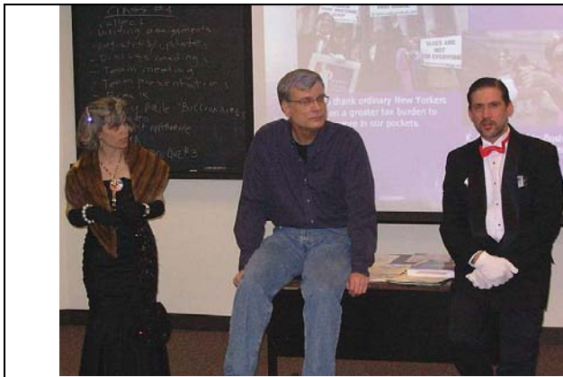
We had a number of guest experts when this class was offering in the Spring of 2006. Above, members of the Billionaires for Bush come in costume.