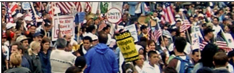
Members of the class investigated the issue of immigration and participated in the May 2006 rally!

One student wrote in their evaluation: "The theory of the principles of direct action organizing (Midwest Academy) has helped me realize why my community group has been ineffective. I have brought some of the ideas from class to my group and we received a grant from an area church to carry out or plan."