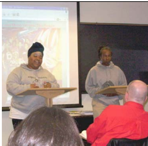
The activist hip-hop performance duo AquaMoon perform in class!